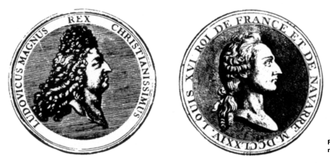
Fig. 1. A typical case of hereditary nose shape: the Bourbon family.

communicators, making the insect limb superficially similar to the vertebrate limb.