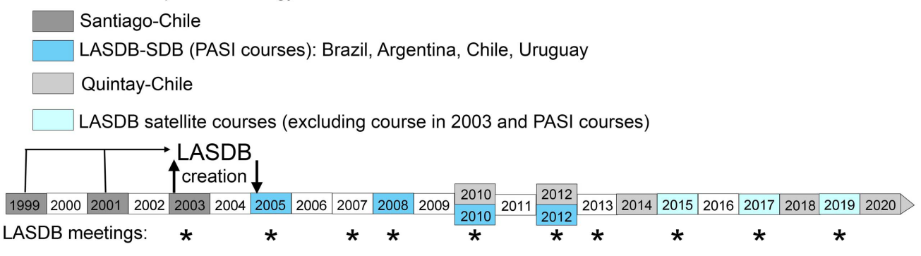
Fig. 7. Timeline of the practical courses on developmental biology associated with the LASDB. 1999 and 2001 courses end up in the creation of the LASDB that had its first meeting and a satellite course in 2003. The courses that started in Santiago and continued in Quintay are shown in two shades of grey. PASI courses in blue and the rest of the LASDB satellite courses in pale blue. Asterisk: LASDB meetings.

Practical Developmental Biology courses linked to the LASDB