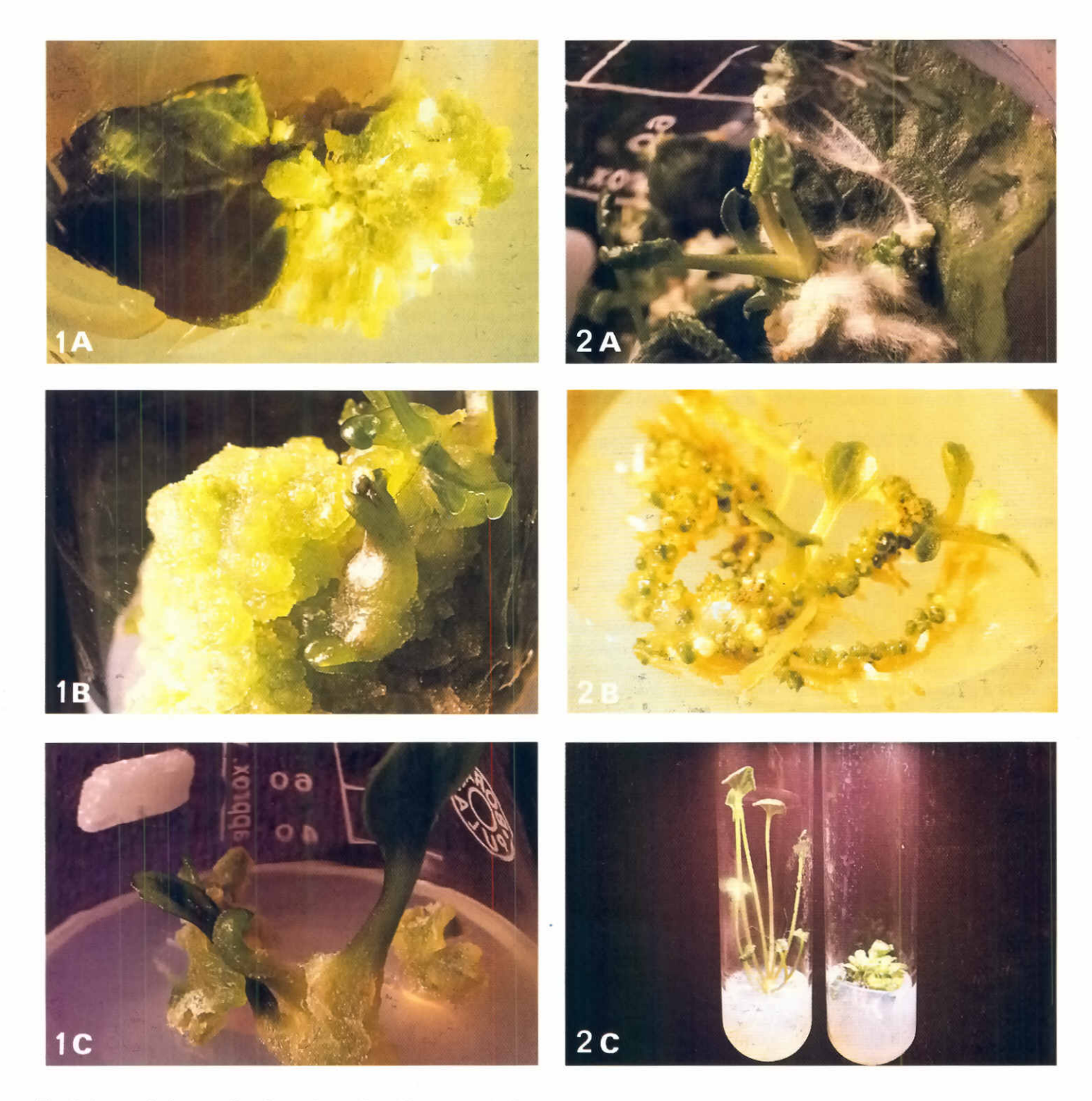
Fig. 1. A. tumefaciens mediated transformation of horse-radish. (A) Primary crown gall tumor induced in leaf explant. Photographed 35 days after infection. (B) Teratogenous tumor with an embryoid consisting of two shoots on the opposite sites of its axis. (C) Tumorous tissue proliferation on the base of shoot explant derived from crown gall tissue.