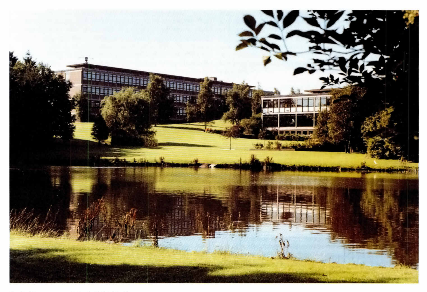
Fig. 3. The campus of Rhode-Saint-Genèse.

these contributions. I shall limit my account to the research themes and principal conclusions that had a major impact on our understanding of developmental biology.