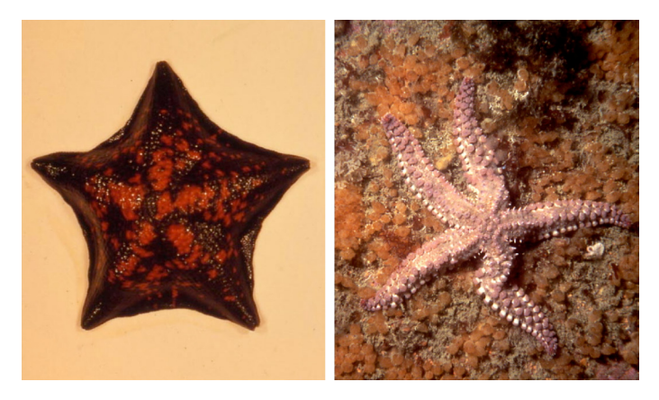
Fig. 3. Japanese and French starfish. Asterina pectinifera and Marthasterias glacialis.