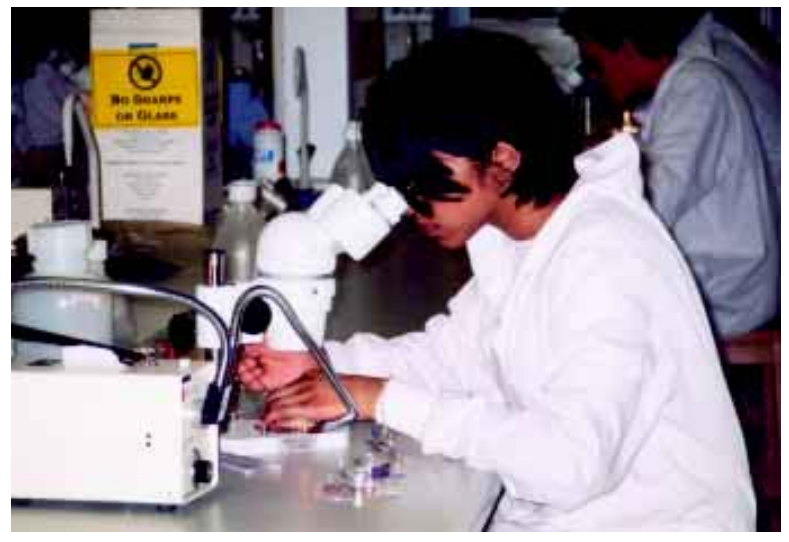
Fig. 3. Student working with embryos under the microscope.

The majority of Bath students do programmes involving professional placement in year 3 (or 6 months of year 2 and 3 for MBiochem). A small number of MBiol placements are based in academic developmental biology labs, for example in 2002/3 Bath students are with the following: