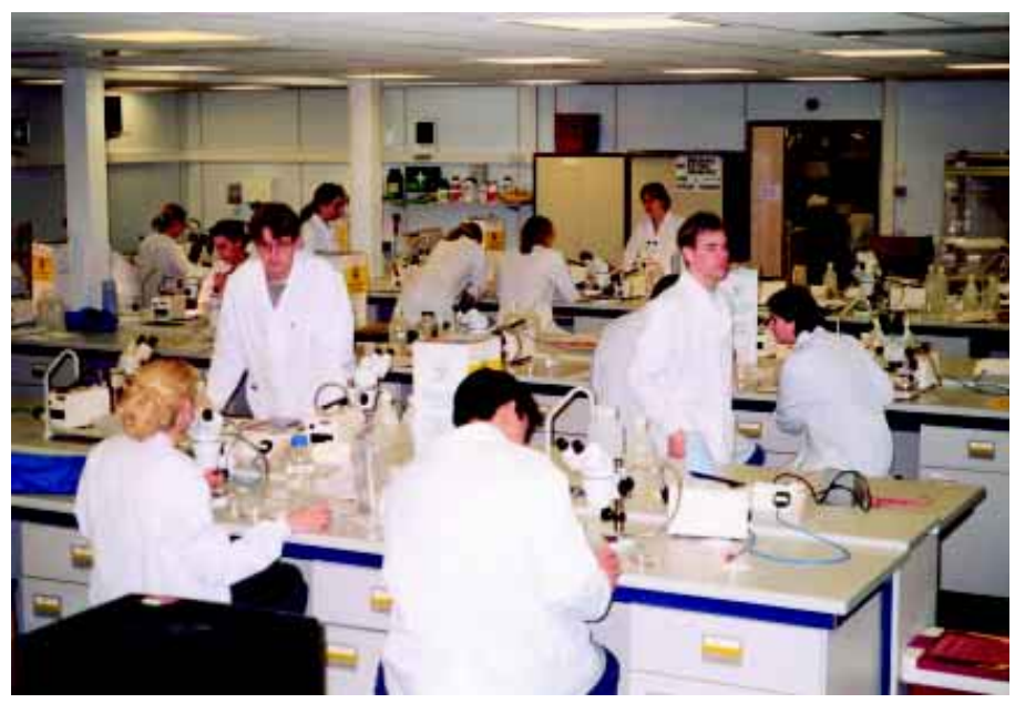
Fig. 2. Practical class, during which Xenopus embryos are handled. Part of Biol0036 Genes and Development Practicals.