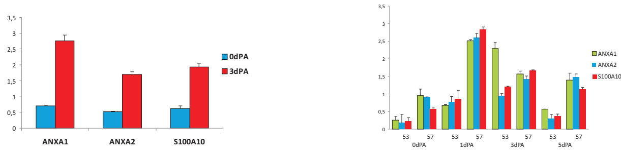
Fig. 2 (Left). qPCR analysis of gene expression. Graphical representation of the qPCR determined level of expression of ANXA1, ANXA2 and S100A10 in 0dPA and 3dPA stage 53 limb tissues normalized to the expression of ODC. Error bars represent the standard deviation from triplicate assays.

Since cells of the distal amputated limb stump undergo dedifferentiation and proliferate to form the regeneration blastema and the relationship of blastema cells to stem cells is not clear, we also