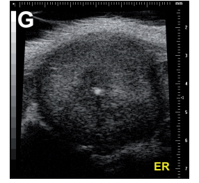
Fig. 1. Phenotyping of interspecific recombinant congenic strain (IRCS) embryo development using ultrasound biomicroscopy revealed lethality phenotypes. Normal embryo development at E9.5 (A), E13.5 (B) and E14.5 (C). Embryo viability was assessed by the presence of heartbeats and a positive umbilical cord Doppler. The LED phenotype (D-G) is characterized by heartbeat arrest (not shown), progressive resorption (PR) of the embryonic structures (D,E), replacement by a high density tissue (F) and eventually, by the general feature of final embryonic resorption (ER), a strong echogenic spot (G). The early embryonic death (EED) phenotype does not involve these phases as it appears directly as an embryonic resorption during US2 (E8.5-E12.5, Fig. 1G). EY, embryo; PL, placenta; UC, umbilical cord; VT, cardiac ventricles; AT, atrium; HD, head; HDT, high density tissue.

proportion of dead embryos at any stage of development relative to the totality of the implanted embryos), compared with the control group (results from the statistical analysis are summarized in Table 2 and Figure 2). Indeed, while the ELR in C57BL/6J was estimated at 4.6 %, the 66H, 103C, 135B and 135E strains showed an increase to respectively, 14.5% (p = 0.025), 19.6% (p= 0.0012), 25% (p= 0.0002) and 18.6% (p= 0.0048). The embryonic lethality observed in 66H and 103C strains was mainly due to the EED phenotype, since respectively 10.5% and 11.8% (p=0.034) of the implanted embryos displayed at US2 the characteristic aspect of the ER. Conversely, 16.7% (p = 6.25 \times 10^{-7} ) of the implanted embryos in the 135B strain and 16.3% (p = 2.77 \times 10^{-10} ) in the 135E strain could rather be classified as LED, since the highest proportion of their ELR, could be observed at US3. Interestingly, in 66H and 103C the remaining fraction of the ELR