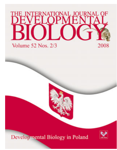
2006 ISI **Impact Factor = 3.577**